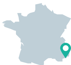
Eurecom campus in Sophia Antipolis