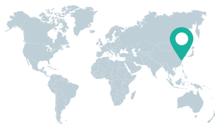
SJTU-ParisTech Elite Institute of Technology campus, in Shanghai

Founding member of Institut Polytechnique de Paris