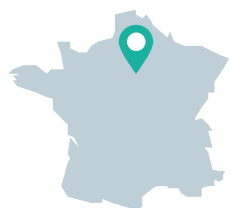
IP Paris campus in Palaiseau

Télécom Paris is the French leading school in digital technology. This public institution is recognized for its strong links with companies, ensures excellent employability rates in all sectors and is ranked number one among major engineering schools for digital technology. Offering excellence in teaching and innovative educational methods, Télécom Paris is at the forefront of a unique innovation ecosystem founded on cross-disciplinary and interactive training, interdisciplinary research, incubators and accelerators for start-ups, and several campuses (Paris, Sophia Antipolis, Shanghai). The school's laboratories have been recognized as leading forces in the fields of digital science, with remarkable international standing, impressive business volumes with the socioeconomic and corporate worlds, and a strong commitment to training.